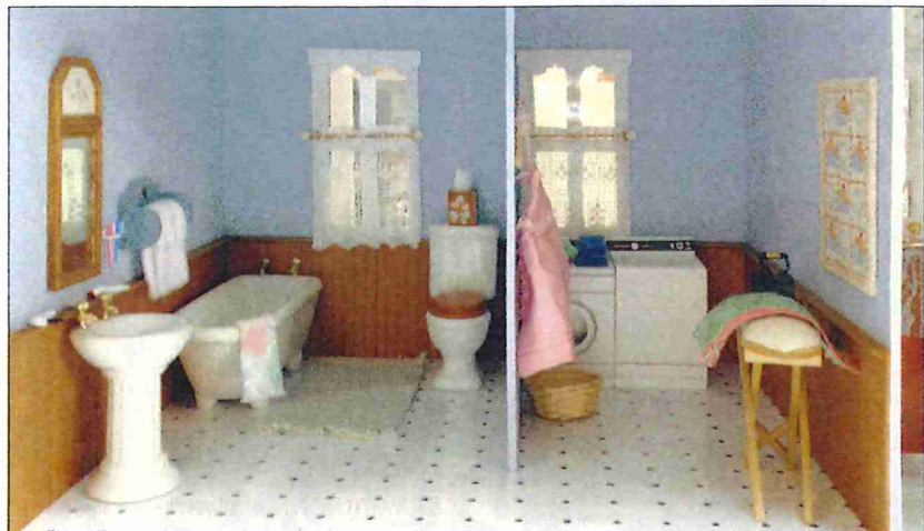
The bathroom and laundry.