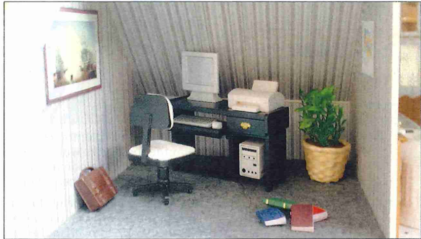
The computer room.